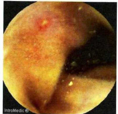
03:00:28 SB erosion.