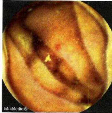
02:40:11 Red spot.