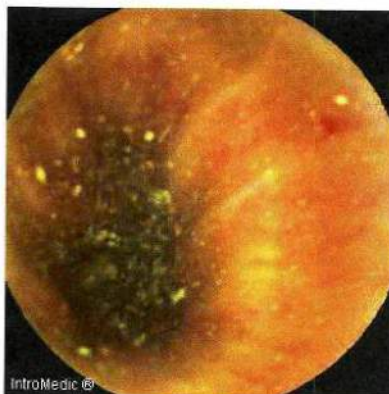
05:43:30 Red spot.