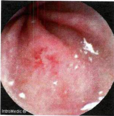
00:03:43 Antral erosion.