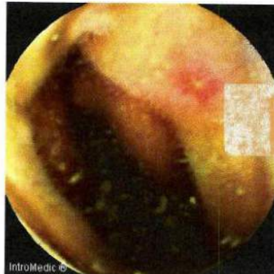
02:57:55 SB erosion.