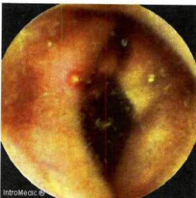
03:37:19 SB erosion.