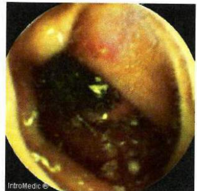
02:55:20 SB erosion.